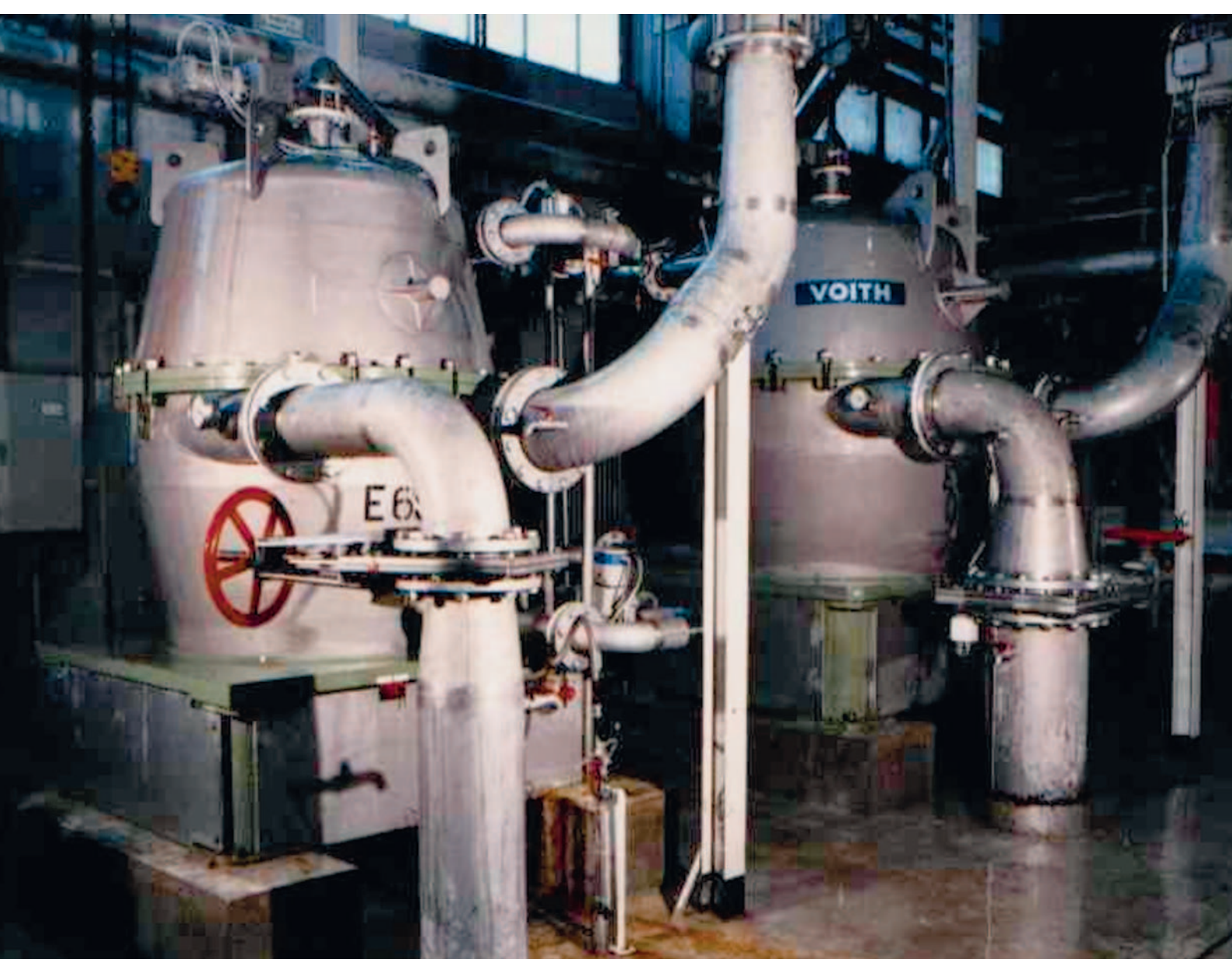
"Spectro Screen 23D" pressure screen, Voith Paper, Germany

Examples of Application Engineering WL 13 518 EA